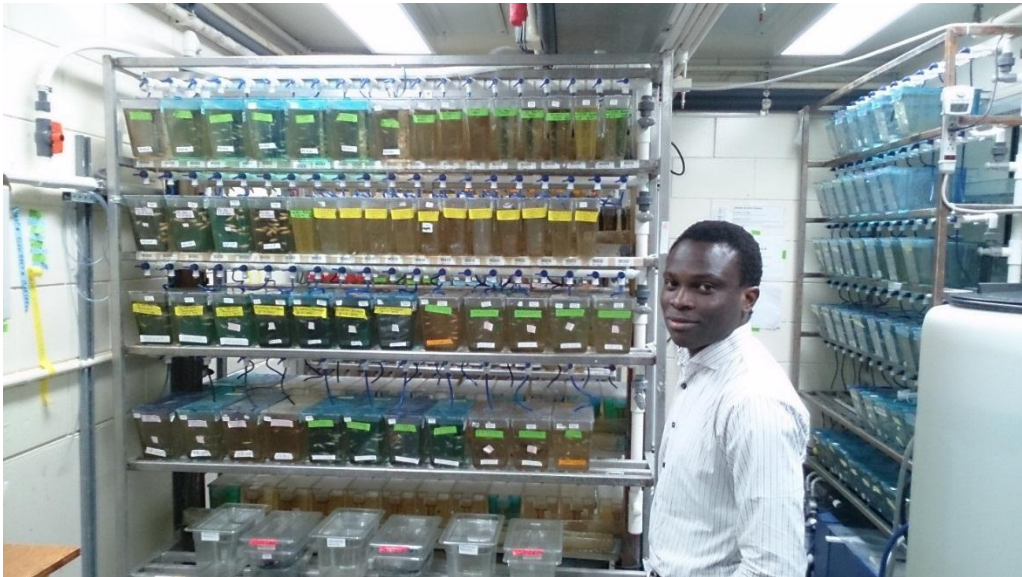
At the SFS fish room (pic 2)