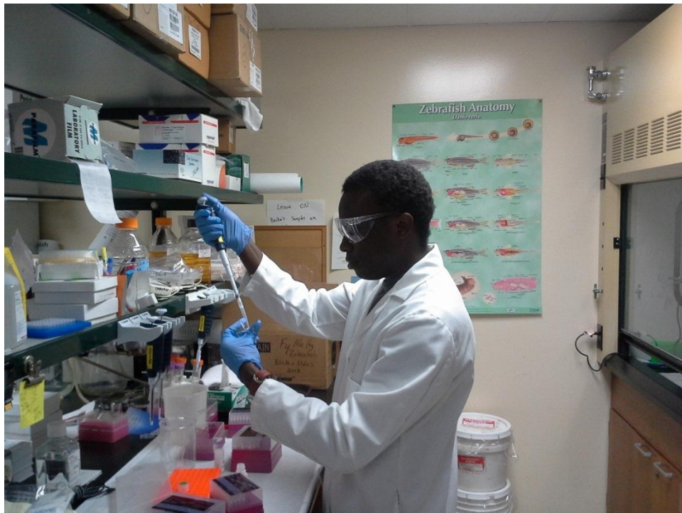
Myself working on RNA extraction