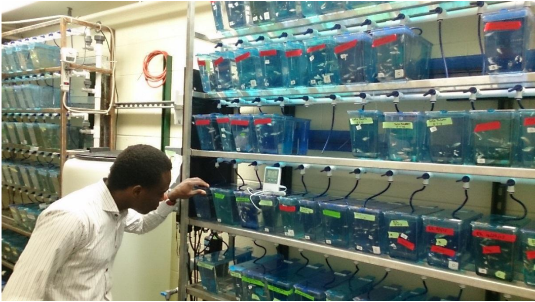
Checking for the health of the fish (pic 1)