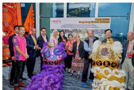
Eye-dotting tradition in lion dance performance