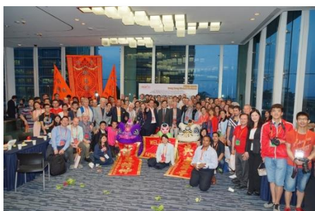
Participants surprised and excited to experience the Chinese Cultural performance in a scientific conference