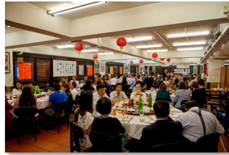
Gala Dinner at a traditional Cantonese restaurant