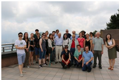
Tour to the peak having city and harbor view of Hong Kong