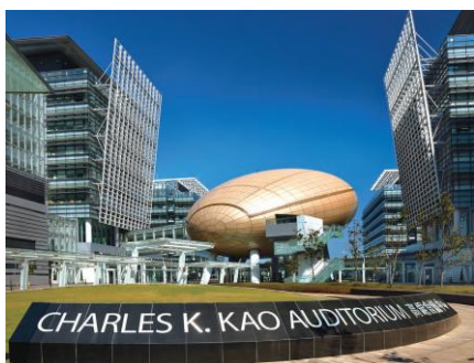
Conference Venue Charles K. Kao Auditorium

Below are some photos highlighting the both the scientific and social parts of the conference. More photos are available on http://www.hkbio.org.hk/icbem/photo.html .