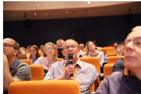
Attendees actively participated in discussions