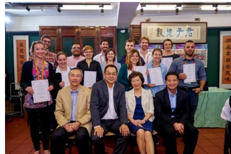
Some travel award recipients joined the dinner and received their certificates