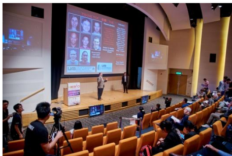
Videography and live webcast service available