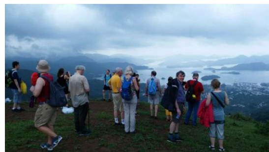
Hiking in the rain - a definitely unusual experience