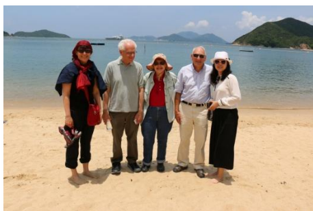
Participants taking a relaxing stroll in Repulse Bay Beach