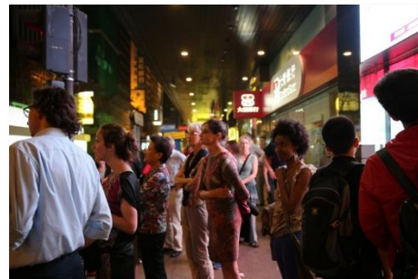
Tour to city centre after full-day scientific program