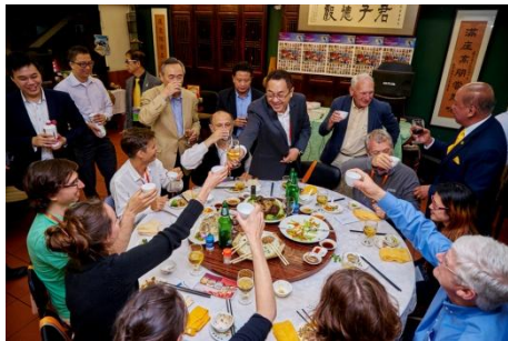
Participants toasting with each other