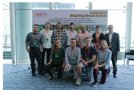
Oral Presenters with session chair and conference president