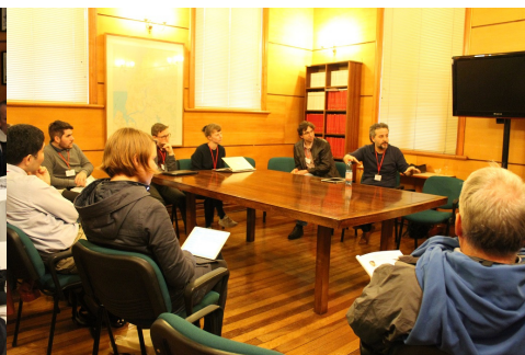
Evening Discussion Group II