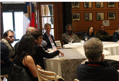
Evening Discussion Group I