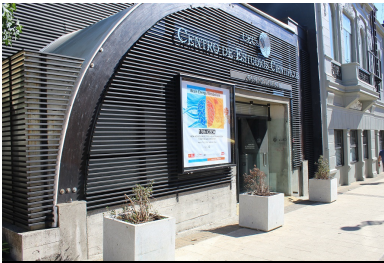
Center for Scientific Studies

For a wider selection please look into the conference website at http://cecs.cl/icbem/