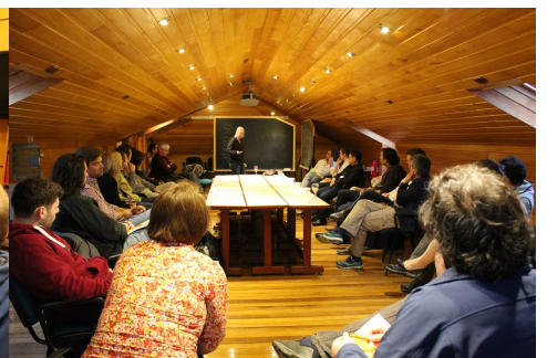
Evening Discussion Group III