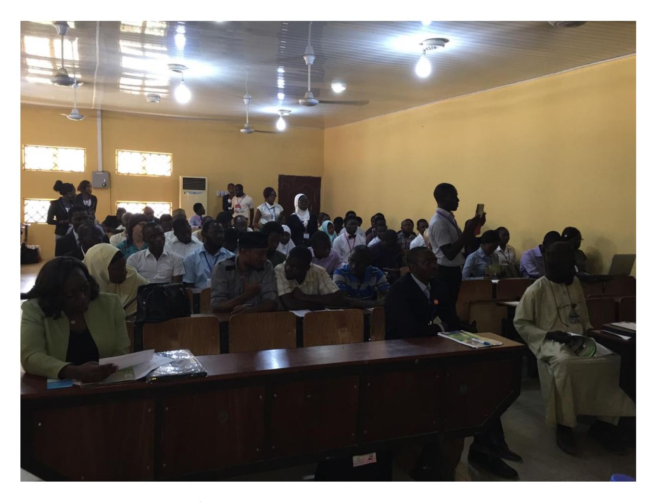
Some participants at the Conference