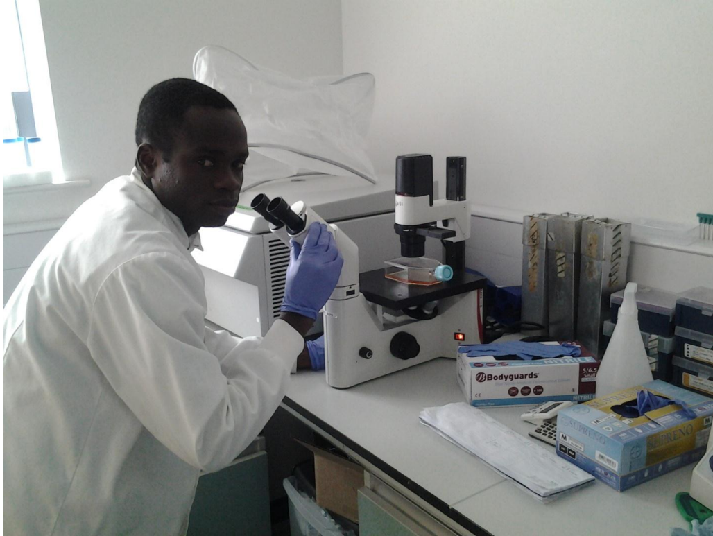
At the tissue/cell culture lab checking for proliferation of SH-SY5Y cells.