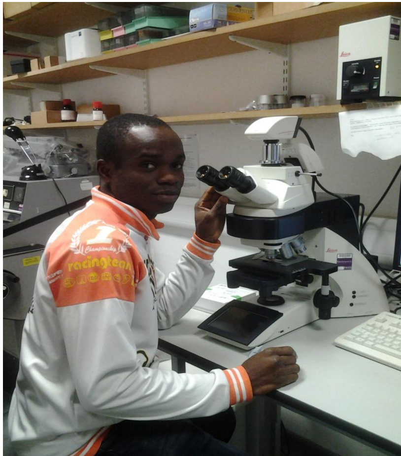
Viewing slides on fluorescence microscope