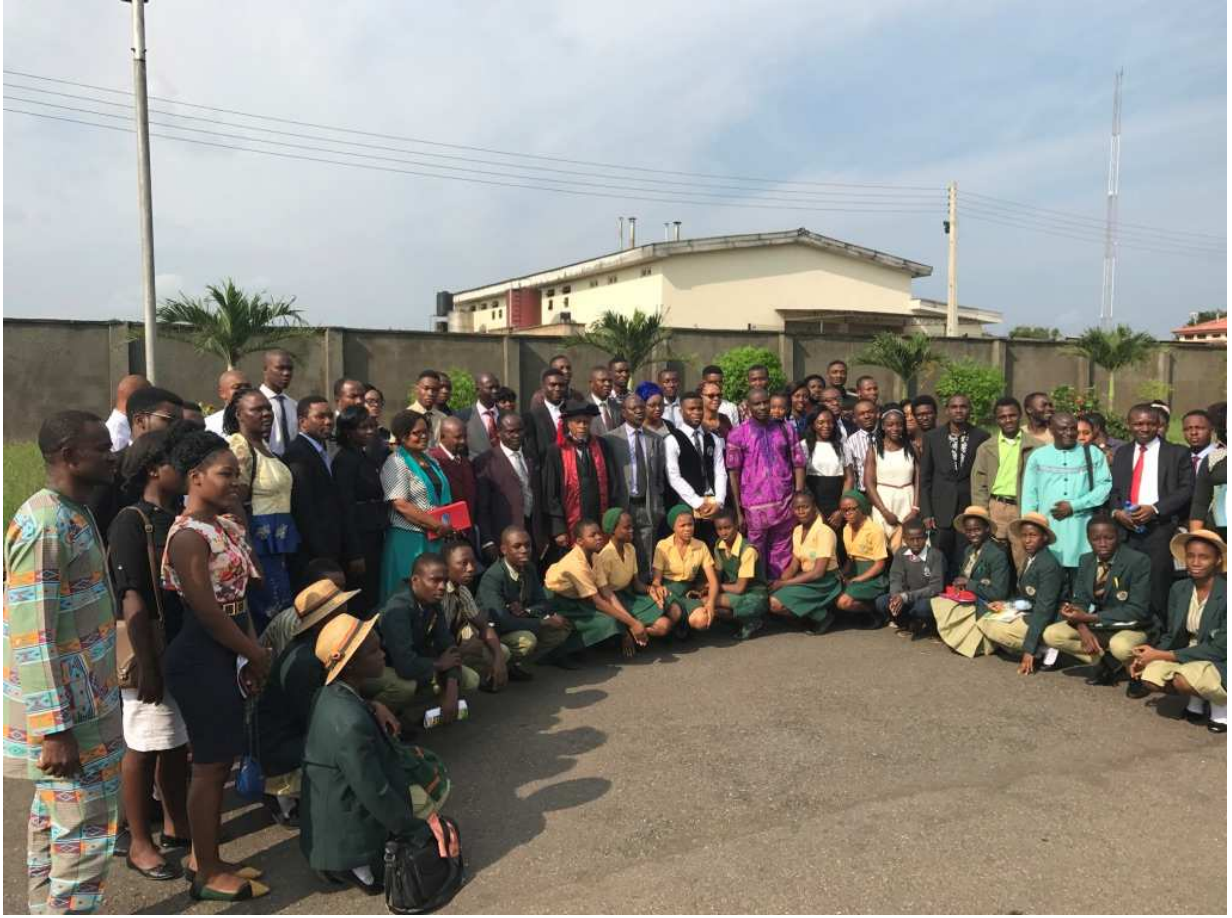
Participants at the Nigeria Neuroscience Workshop in Babcock University in a group photograph