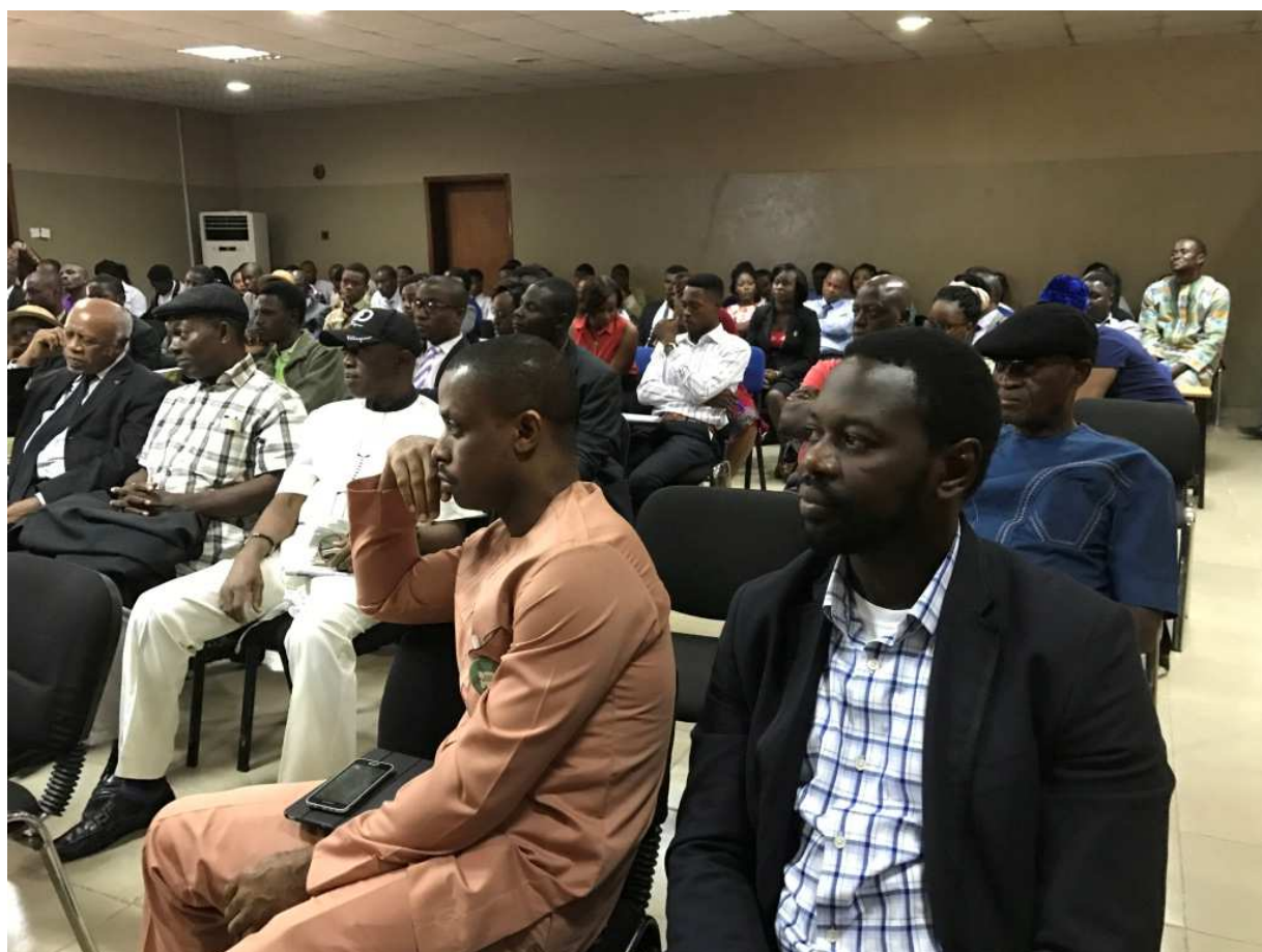
Participants at Nigeria Neuroscience Workshop listening attentively to the presentations

Media: the events of the Workshop were carried by several media in Nigeria – Newspapers and radio.