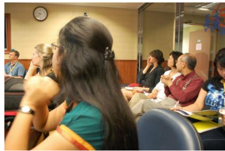
Figure 2. Photographs of students and faculty in the laboratory hands-on sessions or student presentation sessions.