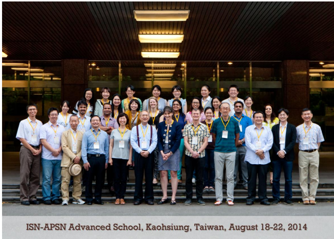
Figure 1. Group photograph of overseas and local faculty, together with local staff and students taken in front of the Children's Building, Chang Gung Memorial Hospital, Kaohsiung, Taiwan on August 18, 2014.