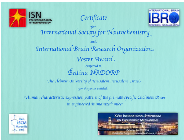
Below: The certificates remitted to the 6 laureates.