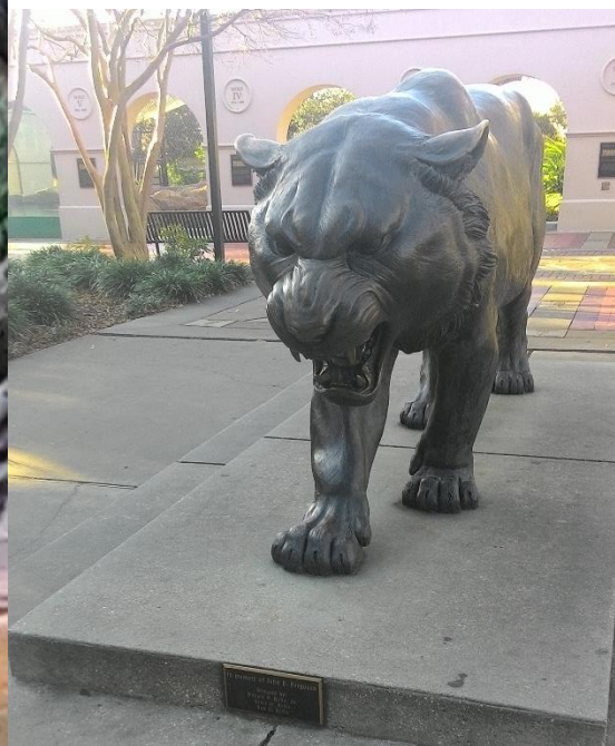
Visit to the university Mascot (Tiger Habitat).