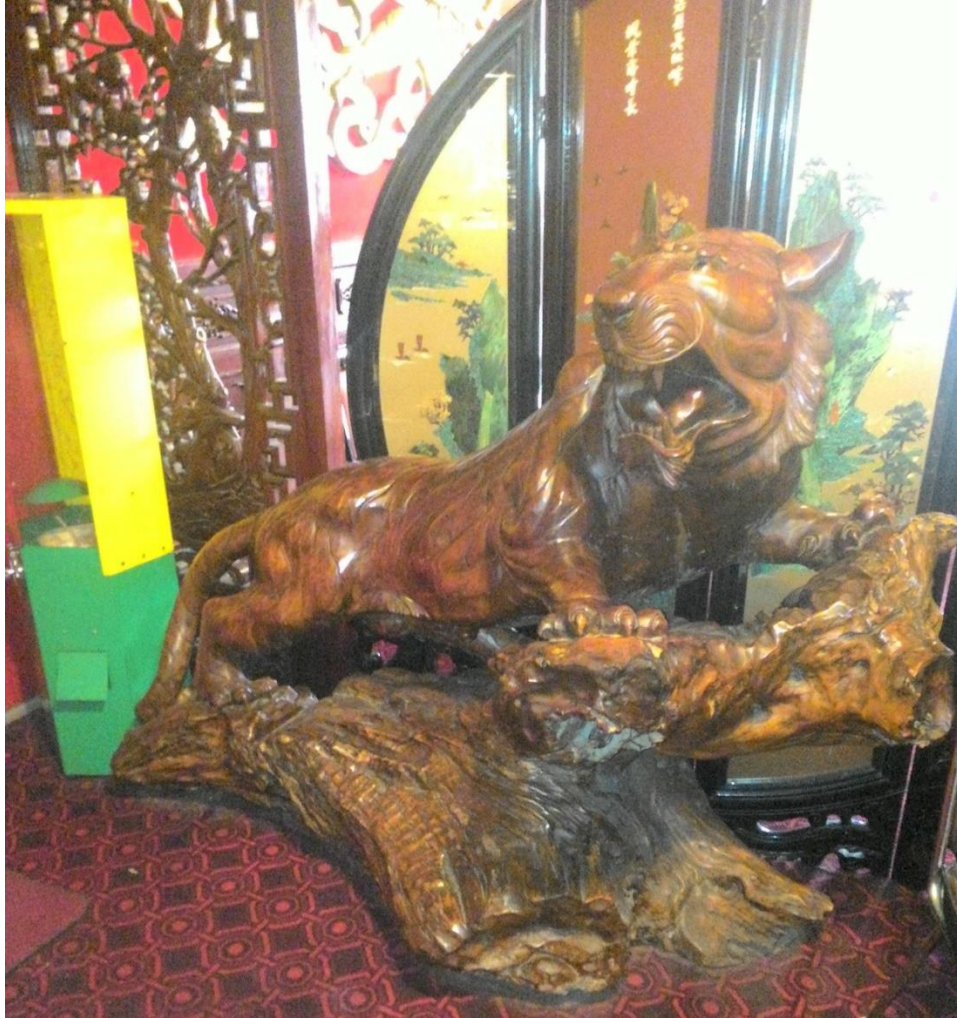
Visit to Chinese restaurant during Amita's Birthday