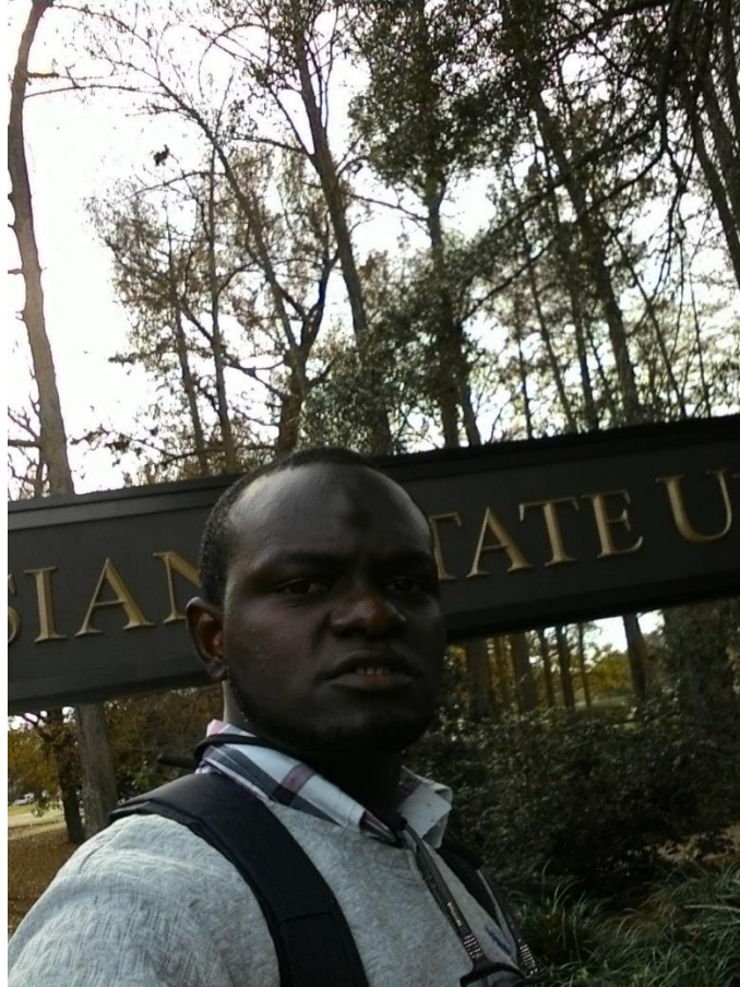
At the University gate