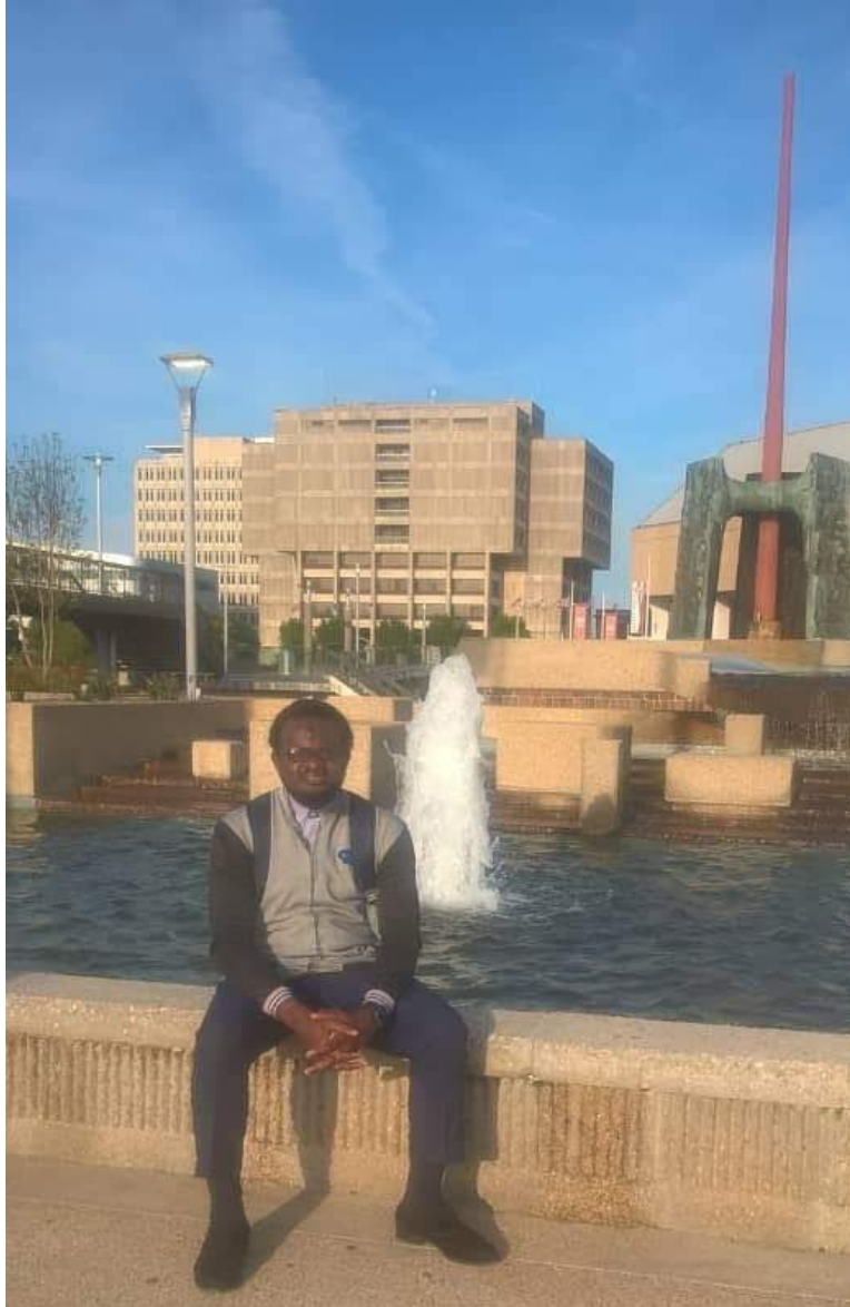
Visit to the symbol of the city (Baton Rouge – Red Stick in the background)