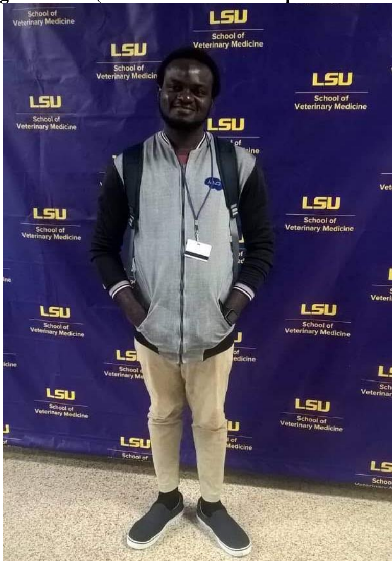
At the school premises