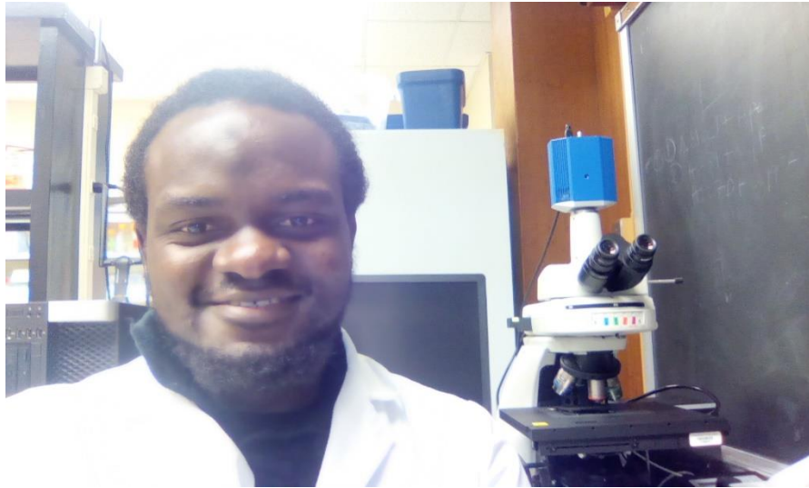
Working in the lab (Fluorescence microscope in the background)