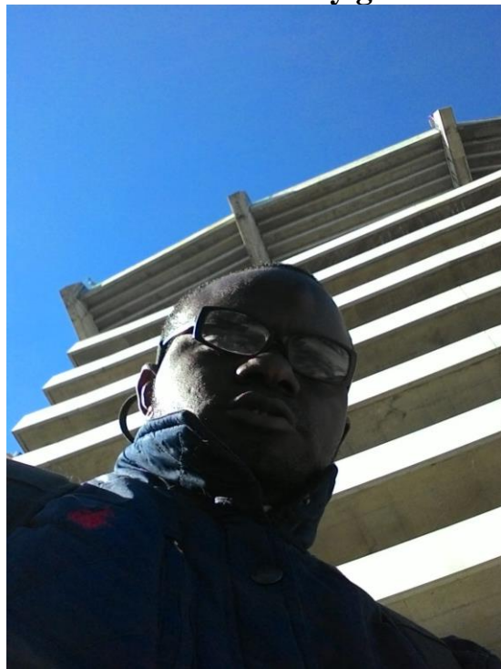
On my way to the lab passing through the University largest stadium